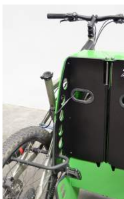
Detall bicicleta lligada i bloqueig tapa amb la protecció endoll/carregador+seient+casc