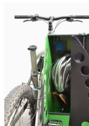
Detall allotjament bicicleta/bateria endollada + protecció seient+ casc